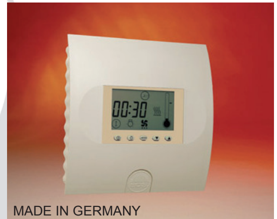
MADE IN GERMANY

Temperature preselection, fault signalling. Connection for dimmable cabin light and fan. Safety temperature limiter 142 °C. Light and fan are fuse-protected internally. With switch-off.